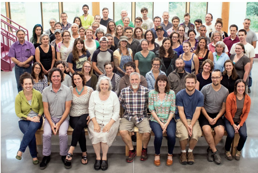
Badger company photo, 2016